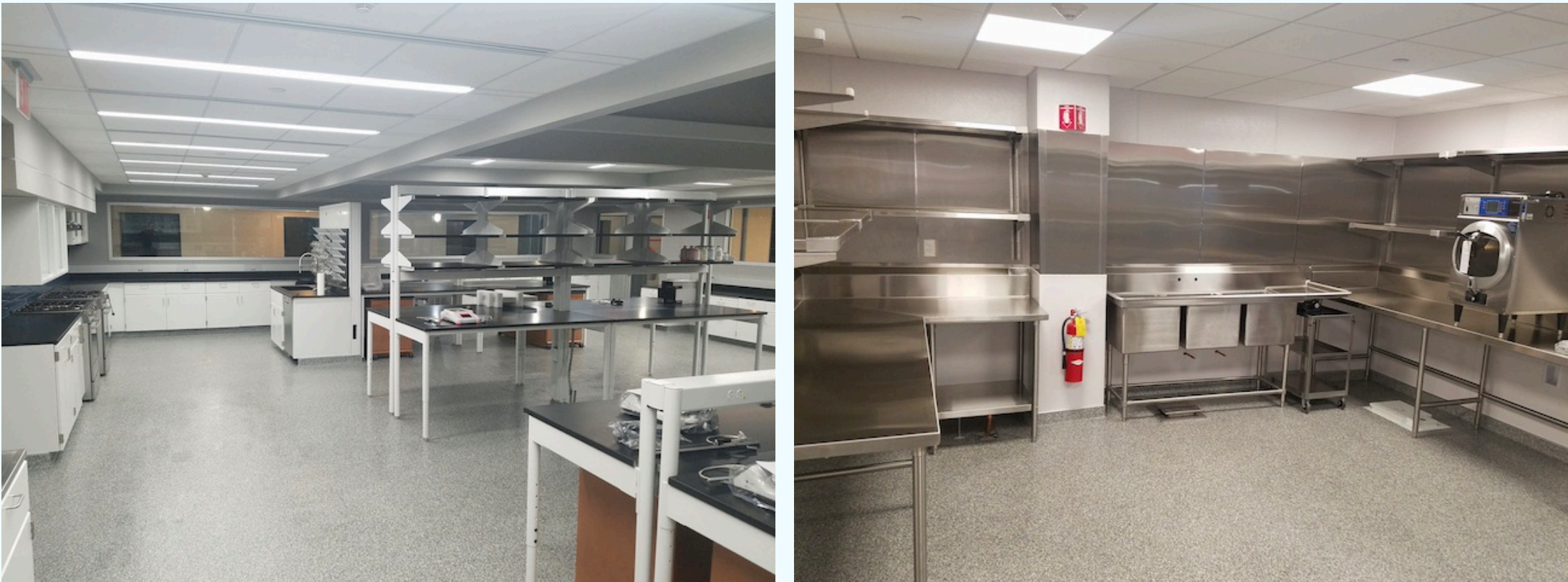
Steuben Foods Case Study