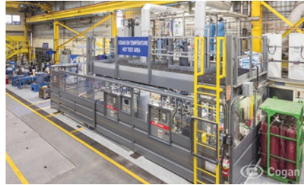
Secure storage & space solutions to protect assets