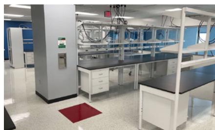
Pharmaceutical, laboratory, sterile, healthcare & controlled environments