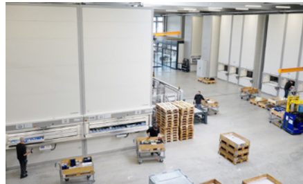
High density storage, automated VLM/carousel