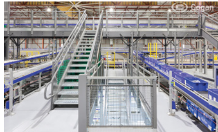
AMR's (automated mobile robots), conveyor systems & integration