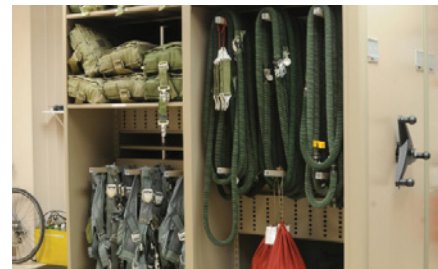
Emergency & 1st responder storage