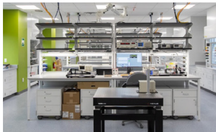
Laboratory & classroom workstations