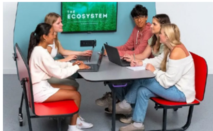
Cafeteria tables & booths