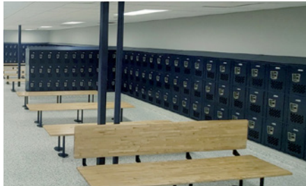
Hallway, gym, & sports lockers