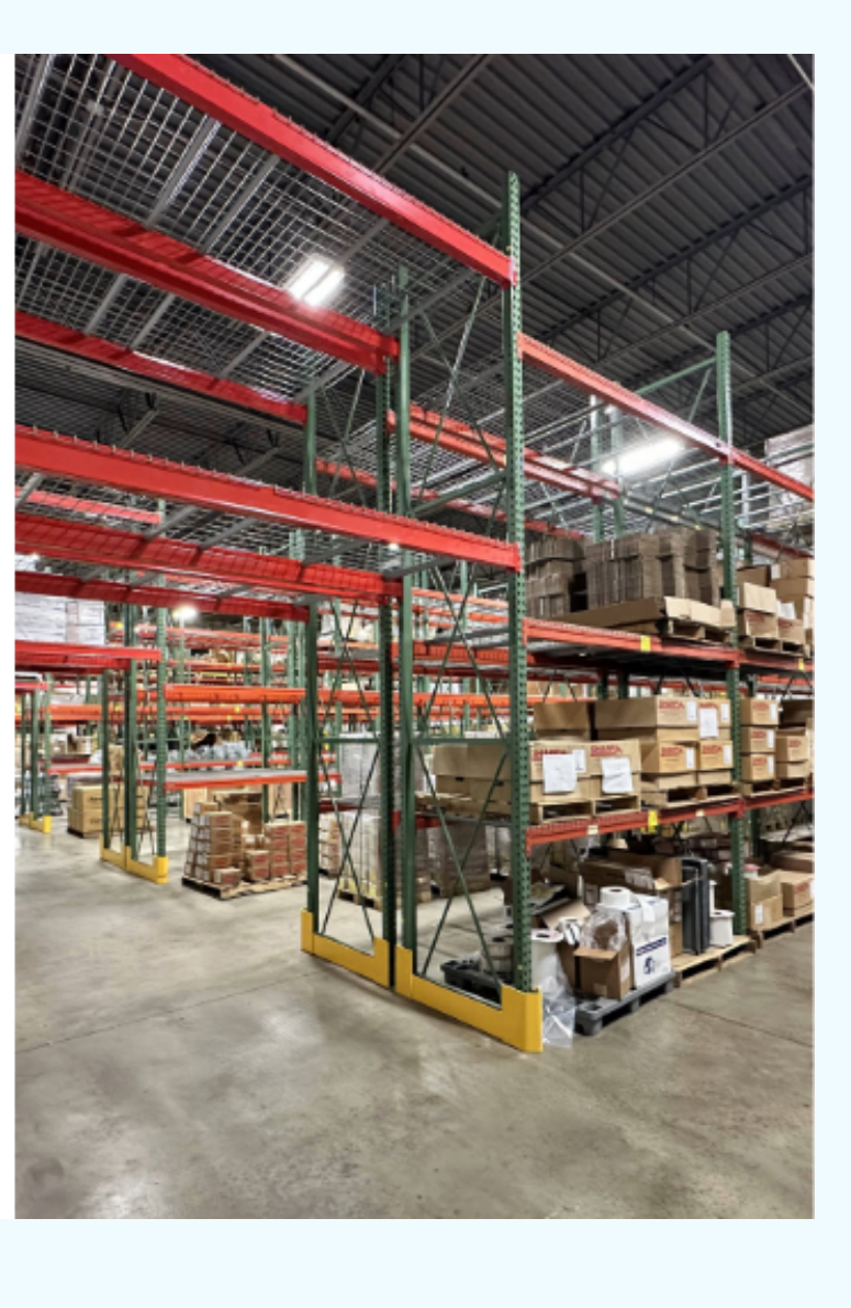
Case Study Spotlight

Kraftwerks recently collaborated with Fairview Ltd. to improve their racking installation.