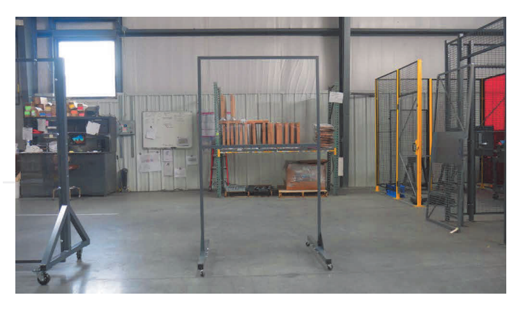
Standard Duty Dimensions: 4' W x 6'- 6" H with 4'x3' Polycarbonate Panel Model KWW-SD

2" SQ <u>#14 Gauge</u> Base with OPTIONAL casters