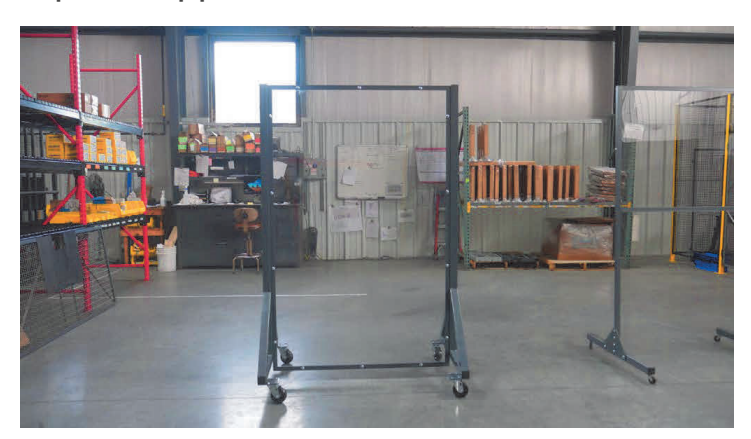
Heavy Duty Dimensions: 4' W x 6' H Polycarbonate Panel with Heavy Duty 2" SQ 14GA post supports Model KWW-HD-14GA

2" SQ #14 Gusseted Heavy Gauge post supports with OPTIONAL casters